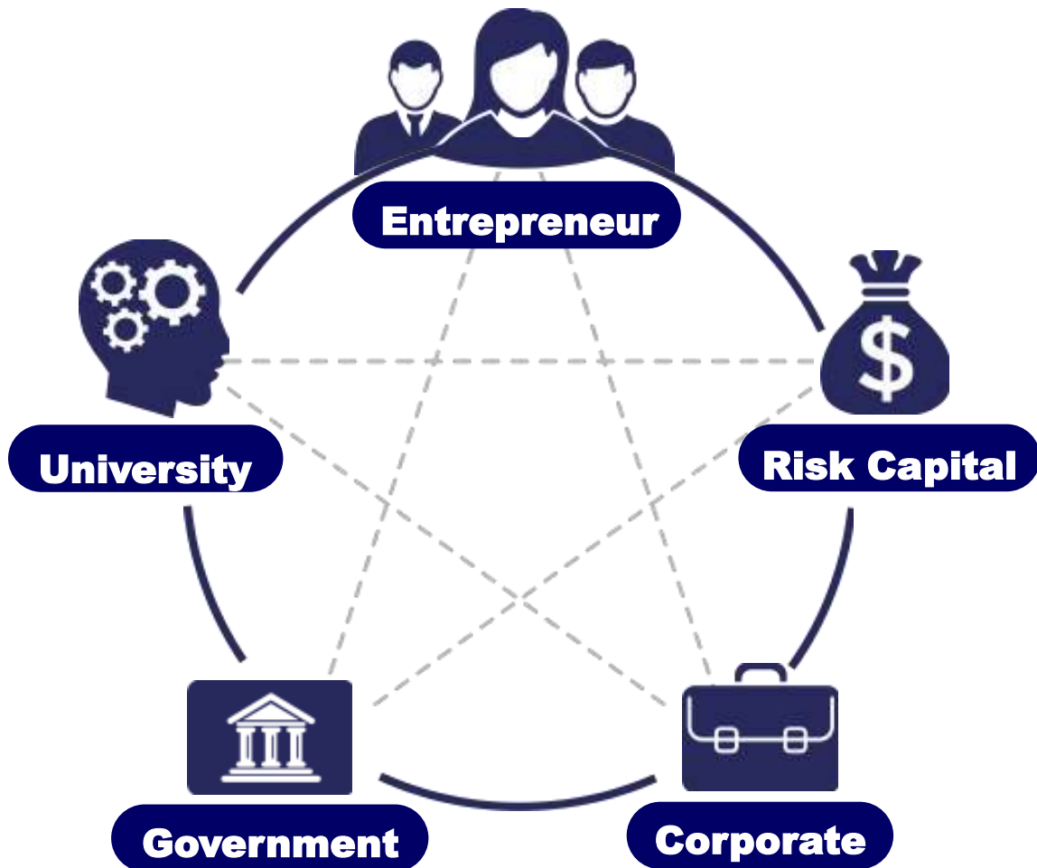
MIT's five stakeholders in an Innovation Ecosystem

The five stakeholders in innovation-driven entrepreneurship ecosystems are as follows: